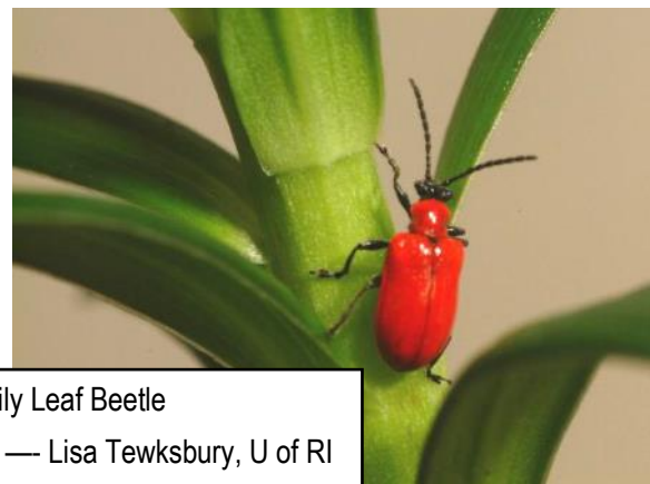
Lily Leaf Beetle

UW-Extension Horticulture: http://hort.uwex.edu/