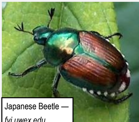
Japanese Beetle — fyi.uwex.edu

The past couple of weeks have been rather busy. The Brown Marmorated Stink Bug (BMSB) is now here in Portage County. Rose chafers are starting to appear. No Japanese beetles yet. The Lily Leaf Beetle is around, so keep an eye on your lilies, only the true lilies though. There has been one case of Septoria Leaf Spot on tomato. Brown and dying leaves on Maple, probably Anthracnose. Rhubarb with an interesting yellow slime on the underside of the leaf, sent to Madison for analysis. Crab apple leaves with interesting purple fungal fruiting bodies, again sent to Madison. Some likely hail damage from earlier storms, showed up looking like dead and dying leaves and branches on willow but a closer look revealed the branches rebudding. The most common weed I.D. thus far has been Corn-speedwell and Chickweed. With the cool