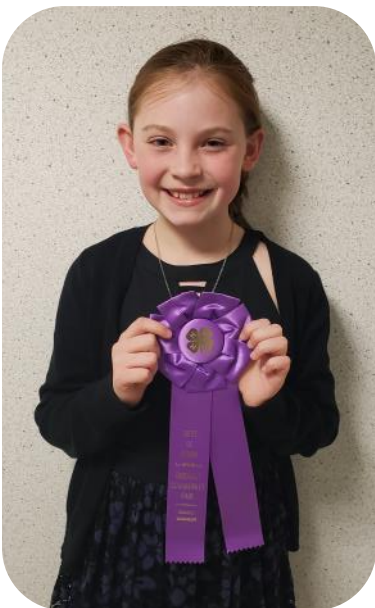
BROOKLYNN, PLOVER CLOVERS— SPEAKING CONTEST BEST OF SHOW FOR STORYTELLING GR. 5 & UNDER