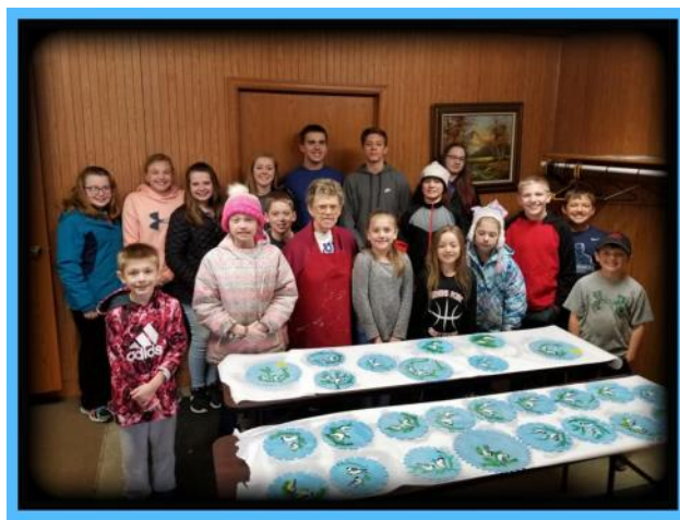
The Carson Climbers Club painting Chickadees on saw blades as a project during their March meeting.