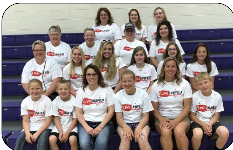
Pictured Above: Members of Portage County 4-H program volunteered at the Special Olympics State Summer games on June 7th.