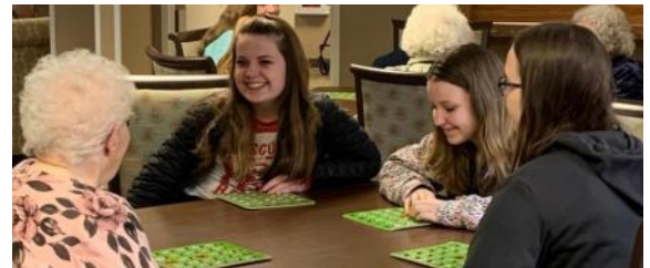
Members of the Carson Climbers 4-H Club playing bingo with Brookdale Senior Living residents after January meeting.