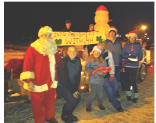
Pictured Left: Members of the Carson Climbers 4-H Club during their Christmas party at Sylvan Hill