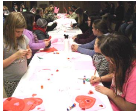
Rosholt Pioneers 4-H members making valentines for the senior citizen meal site.