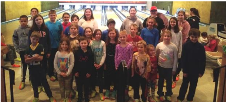
The Nelsonville Zippy Zees had fun bowling at White Tail Lanes in January 2020.