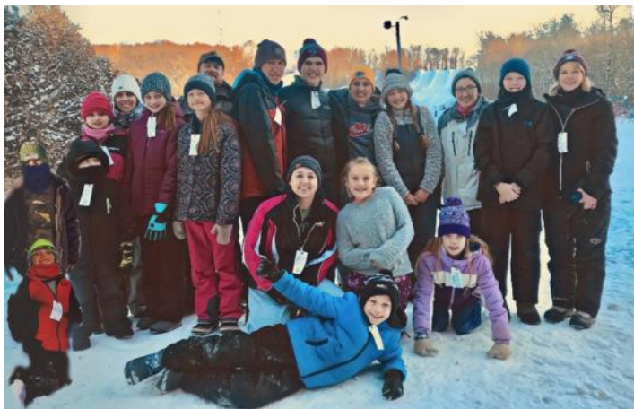
Pictured Right: Members of the Sunnyside Climbers 4-H Club during the Polonia Christmas parade