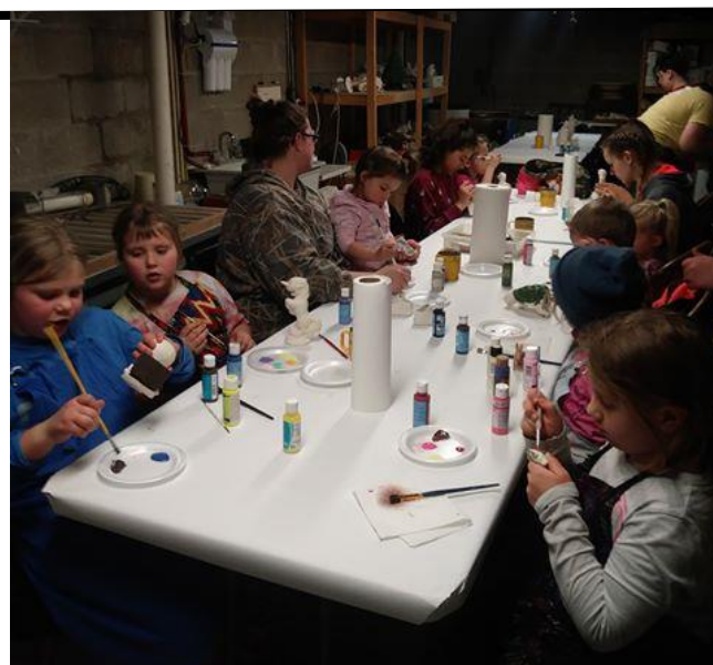
Nelsonville Zippy Zees club members painting their ceramics. (Pictured Above)