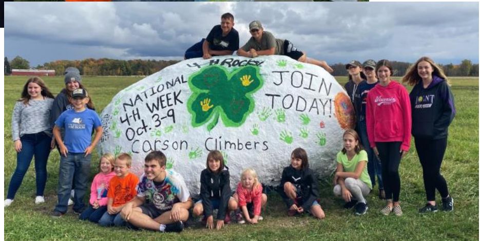
Pictured Above: Carson Climbers club members painted the "Rudolph Rock" for National 4-H week.

Have a cool club event you want to highlight?