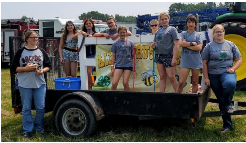
Almond Busy Bees members with their float in the Tater Toot parade on July 31st in Almond.