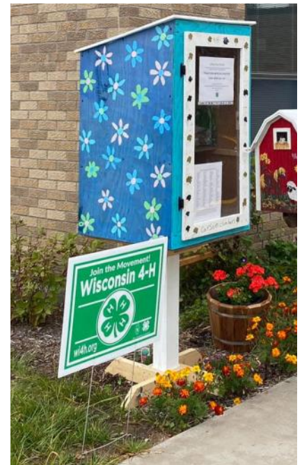
The Carson Climbers made "Little Food Pantries" to help people in the community. Older members made the pantries (with adult help) and then all the members painted each piece. Both are located in Junction City. One at the Junction City Town Hall & the other at Kennedy Elementary School.