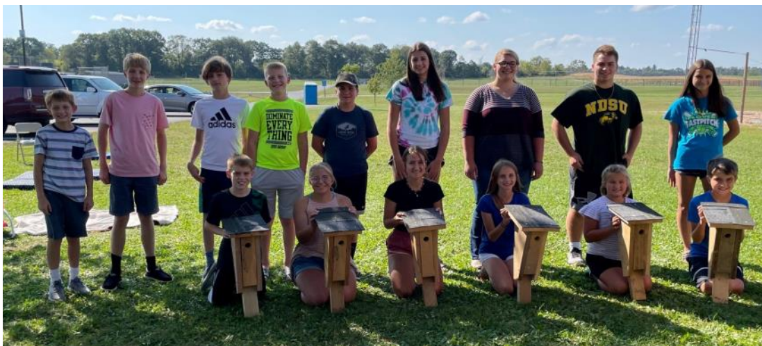
Pictured Left: Tomorrow River Voyages club members with birdhouses that were donated to the club. Club members decided to donate the bird houses to the Amherst school district Falcon Walking Trail. The bird houses will be used for educational activities on the birds that live in there and club members plan to clean and maintain the houses as well.

WEBSITE: HTTPS://PORTAGE.EXTENSION.WISC.EDU/