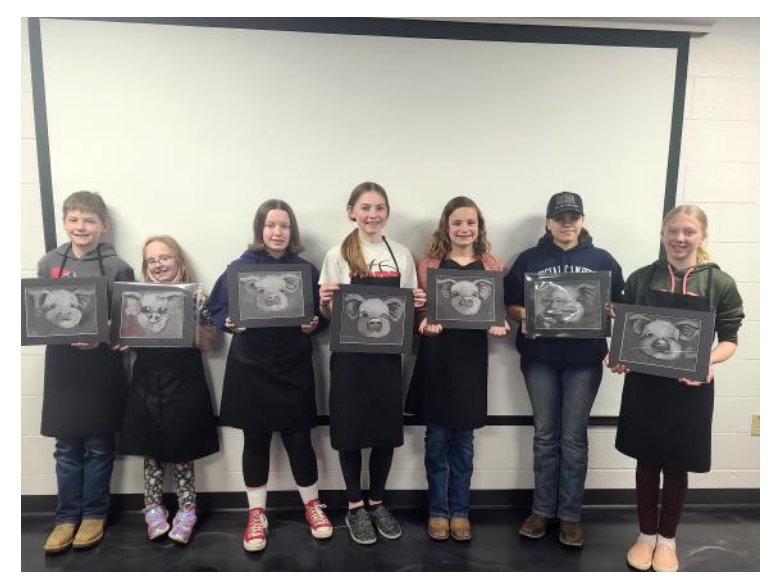
Pictured Above: Members of the Plover Clovers did an activity together creating these great charcoal drawings of pigs.