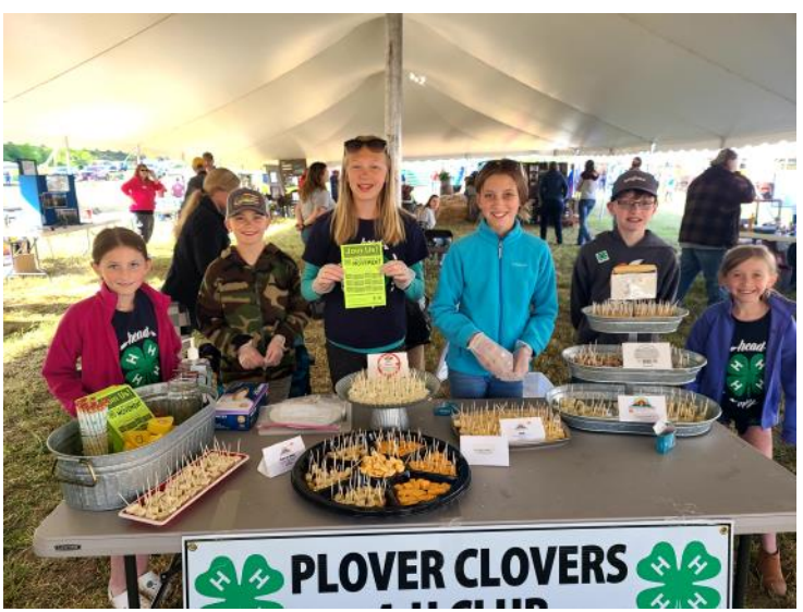
Pictured Above: Members of the Plover Clovers hosted a cheese tasting table at June Dairy Days.