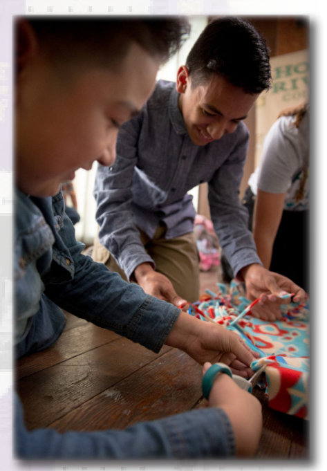
Completing a craft project or helping out with a club community service project are great things to include in yo<mark>ur records!</mark>

An EEO/AA employer, University of Wisconsin-Madison Division of Extension provides equal opportunities in employment and programming, including Title VI, Title IX, the Americans with Disabilities Act (ADA) and Section 504 of the Rehabilitation Act requirements.