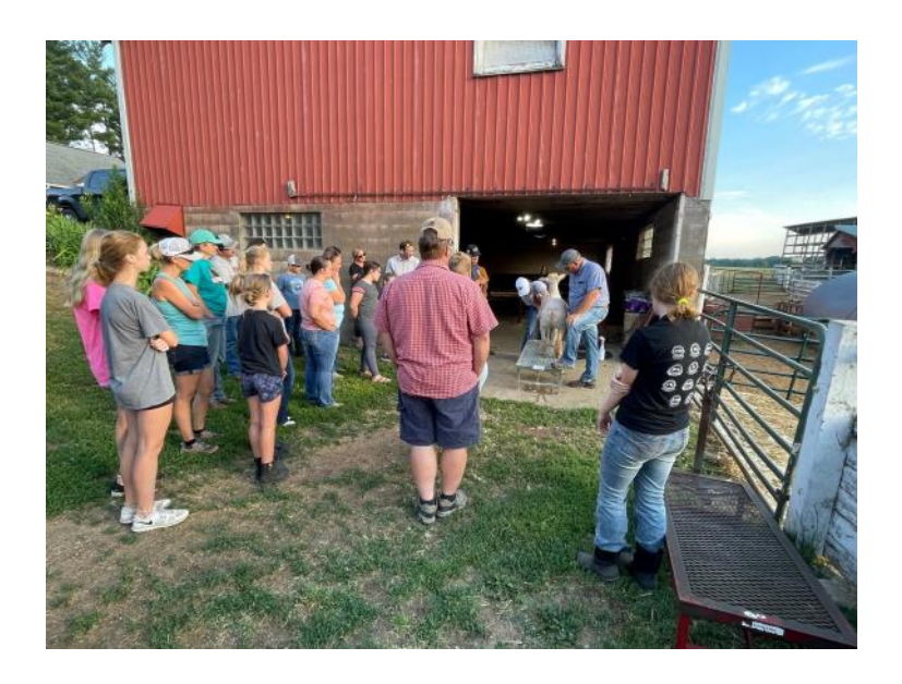
Pictured above: Participants at the July 5th Lamb workshop. Topics covered included showmanship and fitting, and nutrition