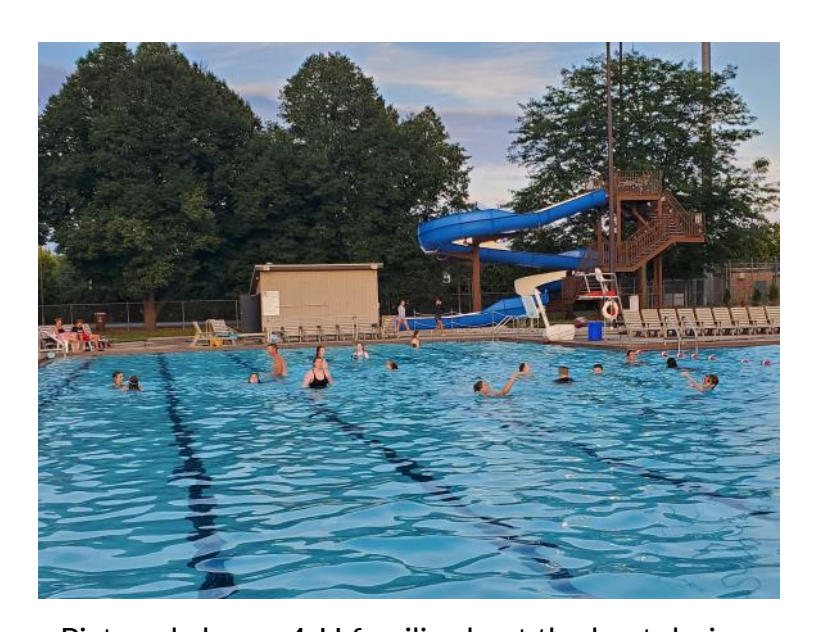
Pictured above: 4-H families beat the heat during the 4-H Family Swim Party on August 1st at the Donald Copps Municipal Pool in Stevens Point