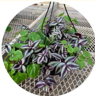
SHADE COMBO - FOLIAGE PLANTS ONLY

Photos are Examples - Colors and Plant Types Vary