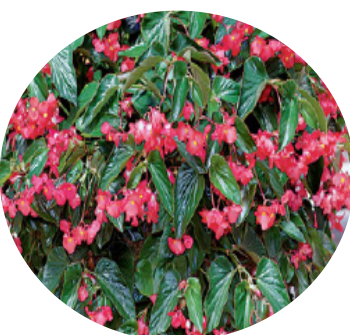
DRAGON WING BEGONIA