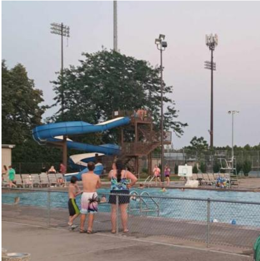
Pictured Right: 4-H families beat the heat during the 4-H Family Swim Party on August 13th at the Donald Copps Municipal Pool in Stevens Point.