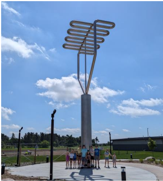
Pictured Left: Members of the TR Voyagers Club at the Food and Farm Exploration Center to learn how farms work. They also saw the World's Largest Potato Masher!