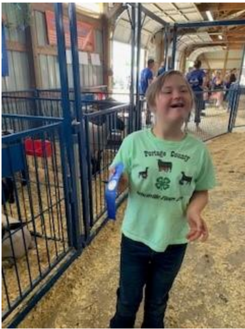
Pictured Above & Below: 4-H Members at the Rosholt Fair.