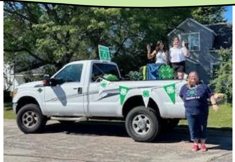
Pictured Above: 4-H Ambassadors and Ambassador advisor getting ready for the Rosholt Fair Parade.

The Tomorrow River Voyagers provided facepainting at the Celebrate Amherst Event. It was a beautiful day and members enjoyed meeting their customers!