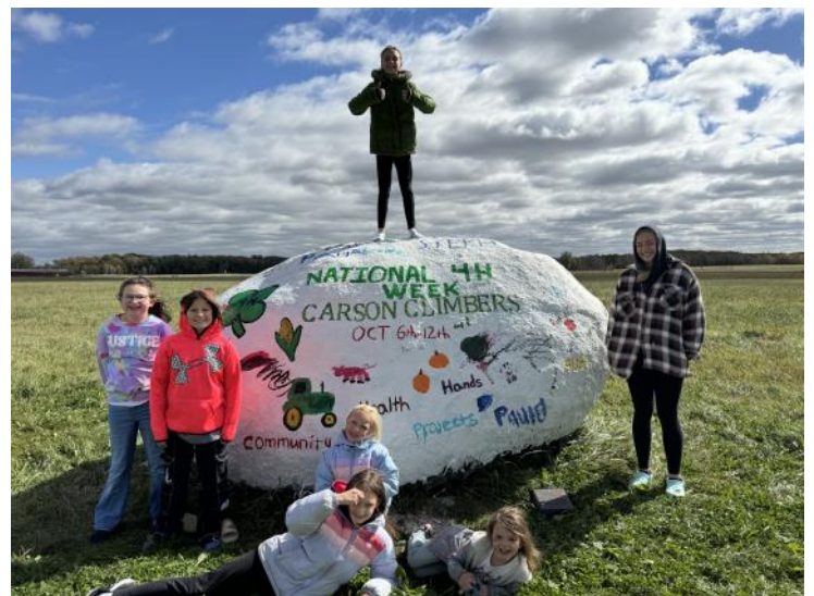
Pictured Above: Carson Climbers members painting the "Rudolph Rock" for National 4-H Week.