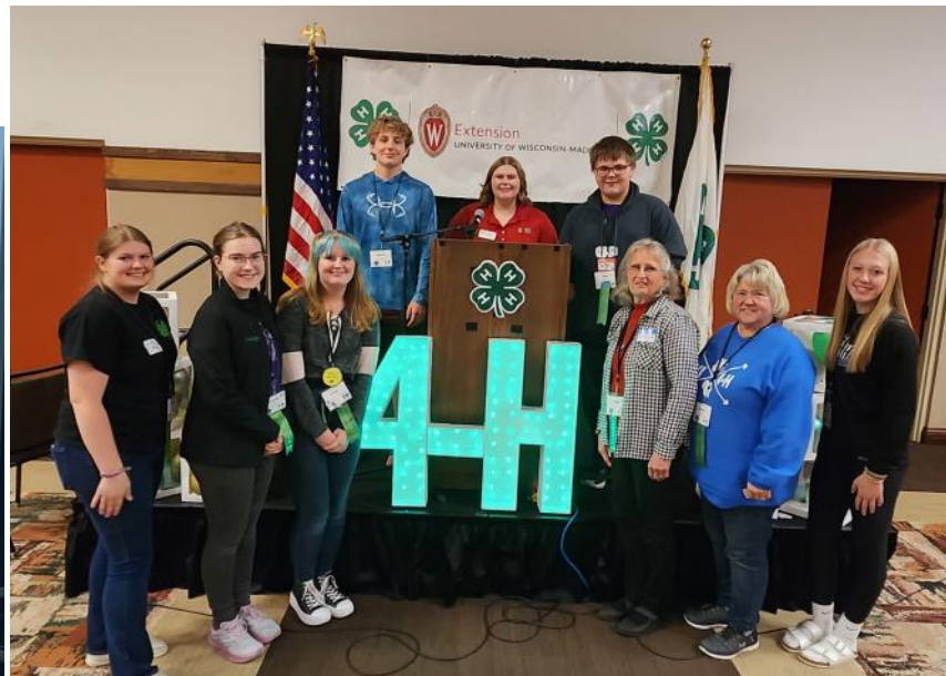
Pictured Above: Portage County 4-H members and leaders who attended Fall Forum held in Stevens Point.