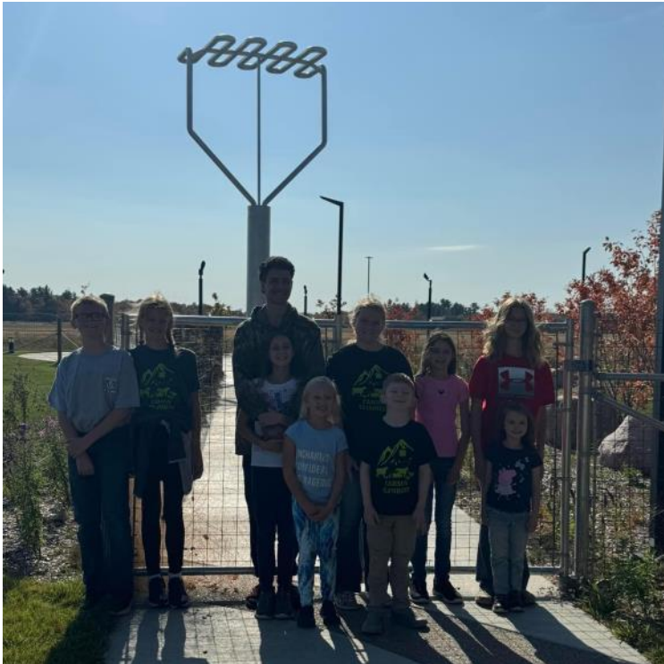
Pictured above: Members of the Carson Climbers 4-H Club at the Food and Farm Exploration Center.