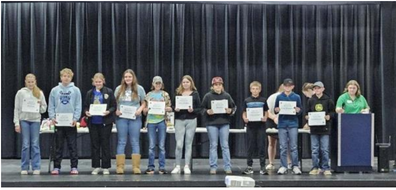
Pictured Above: 4-H members receiving awards at the 2024 Portage County 4-H Awards Program held on November 3rd.

Just a reminder we have a Portage County 4-H group on Facebook! Members can get program updates, share updates from their clubs and connect with other Portage County 4-Hers! Search "Portage County 4-H, WI" to join!