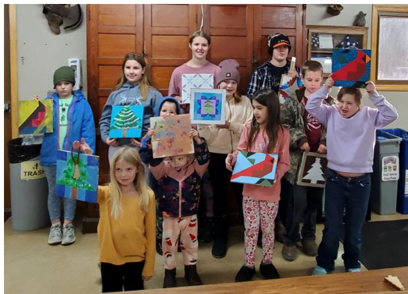
Participants at the Holiday Barn Quilt Workshop