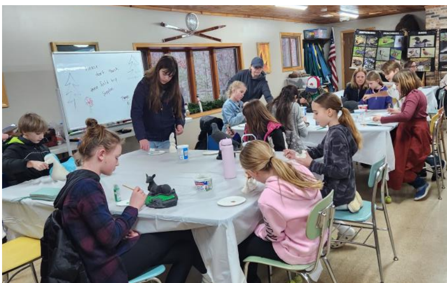
Participants at the December 15th ceramics workshop held at the Boston School Forest

An EEO/AA employer, University of Wisconsin–Madison Division of Extension provides equal opportunities in employment and programming, including Title VI, Title IX, the Americans with Disabilities Act (ADA) and Section 504 of the Rehabilitation Act requirements. Requests for reasonable accommodations for disabilities or limitations should be made prior to the date of the program or activity for which it is needed. Requests will be kept confidential.