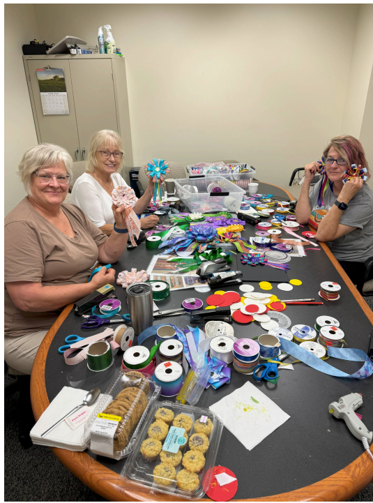
Volunteers from the Stevens Point HCE group create beautiful hand-made rosettes for the Speaking and Demo contest, style review & future 4-H contests. THANK YOU LADIES!