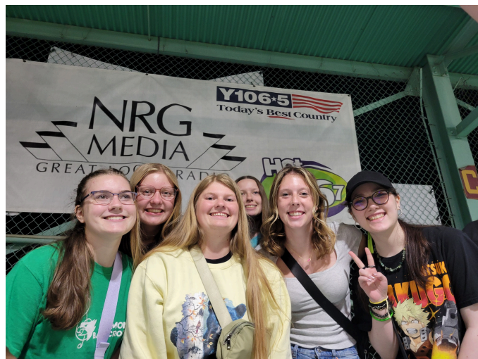
Some of our Teen Leaders at the Rafters Game in Wisconsin Rapids