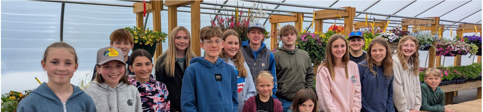
Members of the Tomorrow River Voyagers Club at Antiquity Acres for their June meeting, where members picked out flowers and got a tour of the greenhouses.