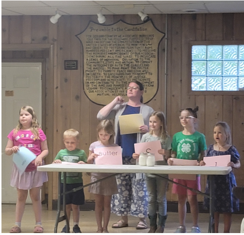
Cloverbuds from the Rosholt Pioneers club during a butter making demonstration at their July club meeting.