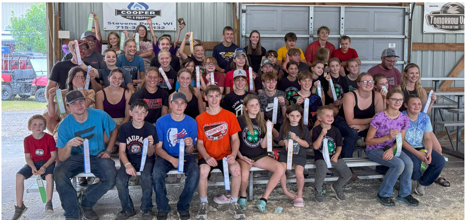
We were thrilled to see so many youth (and kids at heart!) participate in the Ag Olympics at the Amherst Fair this year. We hope to see you all next year- start practicing those wheelbarrow turns!