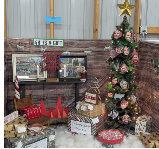
Tomorrow River Voyagers and their 'Christmas in July' themed booth at the Amherst Fair.