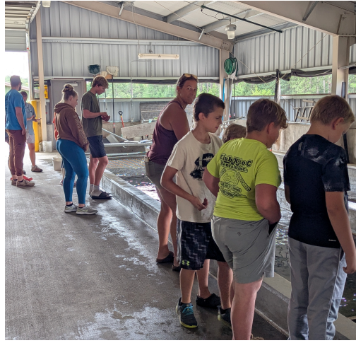
Members of the Tomorrow River Voyagers checking out the fish at the Wild Rose Fish Hatchery