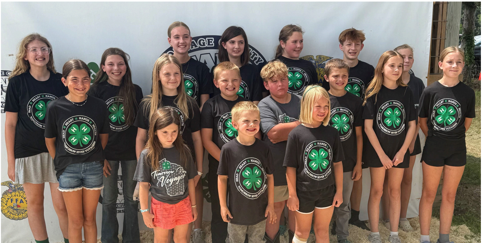
Tomorrow River Voyagers members at the Amherst Fair