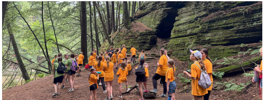
Campers from Portage County, Iowa County & Waupaca County, experienced the beauty and awe of the Dells during their 4-H Summer Camp stay at Upham Woods.